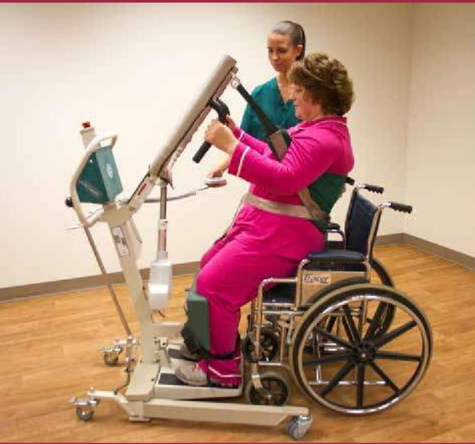
400, 500, & 800 lb. Weight Capacities

The multi-purpose Smart Stand® was designed to be used for toileting and changing briefs of patients, transferring the patient from chair, wheelchair, toilet or bed, and can also be used for ambulation. It features a proprietary circuit board system that provides customers with added intelligence and safety features including: