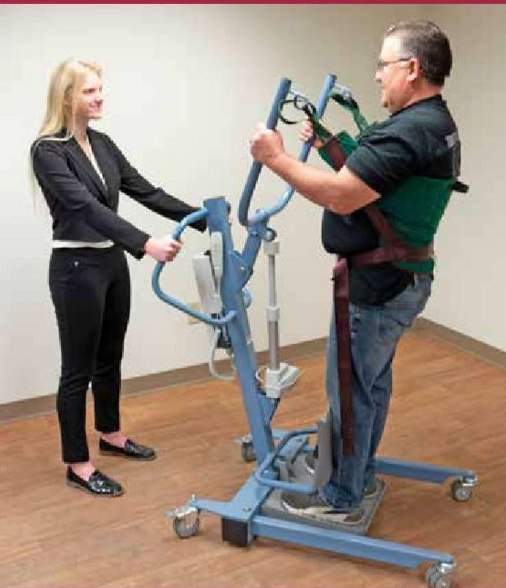
400 lb. Weight Capacity

The high quality alternative to low cost stands. The same high production quality you have come to expect from EZ Way.