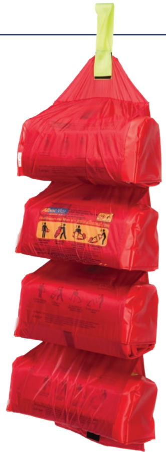
ALBHLD03 Holds four standard or large mats